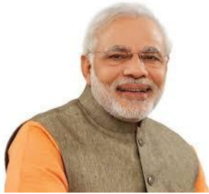
HON'BLE PRIME MINISTER OF INDIA SHRI NARENDRA MODI

The vision of our Hon'ble Prime Minister Shri Narendra Modi is "If we have to build the Nation then we have to start from the Villages" and he believes that "If every Member of Parliament transforms villages in his/her constituency into model villages then large number of villages in the country would have seen holistic development". Our Prime Minister has requested all the Members of Parliament (MP) of both Lok Sabha and Rajya Sabha to develop one model village in their constituency by year 2016 and two more by 2019.